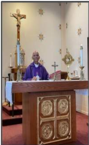
Receive a Smile of Peace

Enjoy the warmth of God's love at DAILY MASS in our beautiful Chapel 8:30 a.m. Monday through Saturday