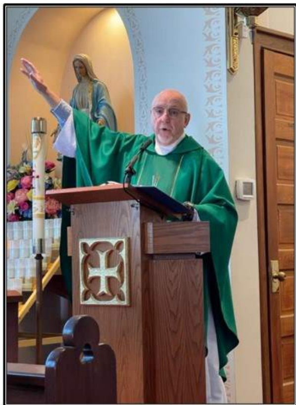
Listen to God's Word

Enjoy the warmth of God's love at DAILY MASS in our beautiful Chapel 8:30 a.m. Monday through Saturday