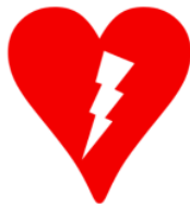
Automated External Defibrillator

One in the Church (in the Usher's Closet near the front entrance) and one in Casey Hall on the wall nearest the Ladies Room. St. Pio's also has 2 AED units. One in the Church parking lot side on the back wall just before St. Pio's Room and one in the Parish Hall on the back wall (street side). Please familiarize yourself with where these are so they can be retrieved in an emergency.