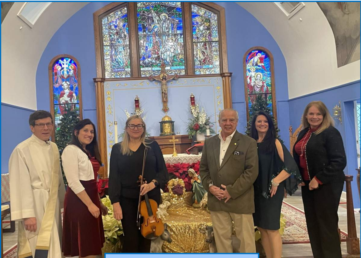
Sacred Heart and St. Pio Music Ministry Thank you for adding so joyfully to our Christmas Liturgies!