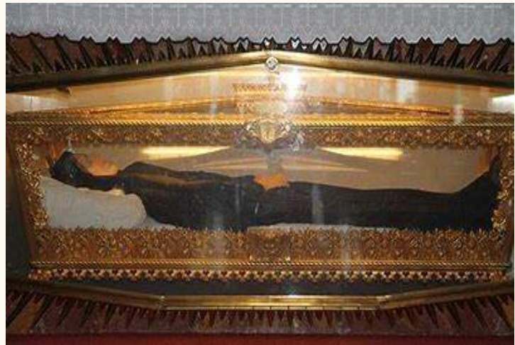
Mother Cabrini's remains in glass casket shaped reliquary