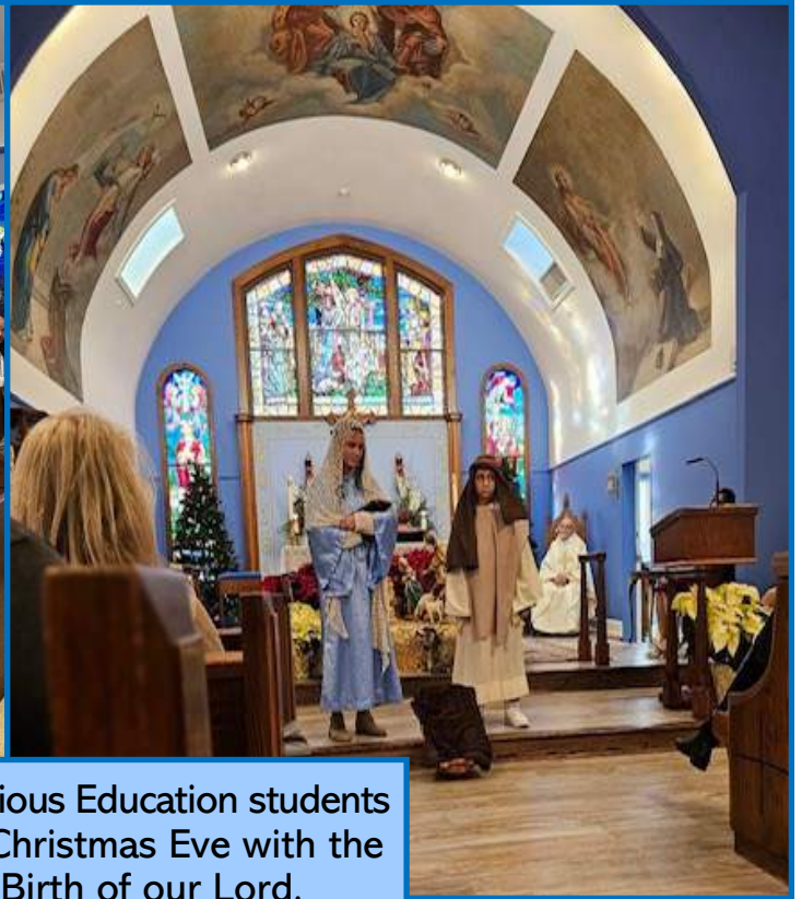
Sacred Heart Religious Education students participating on Christmas Eve with the Nativity and Birth of our Lord.