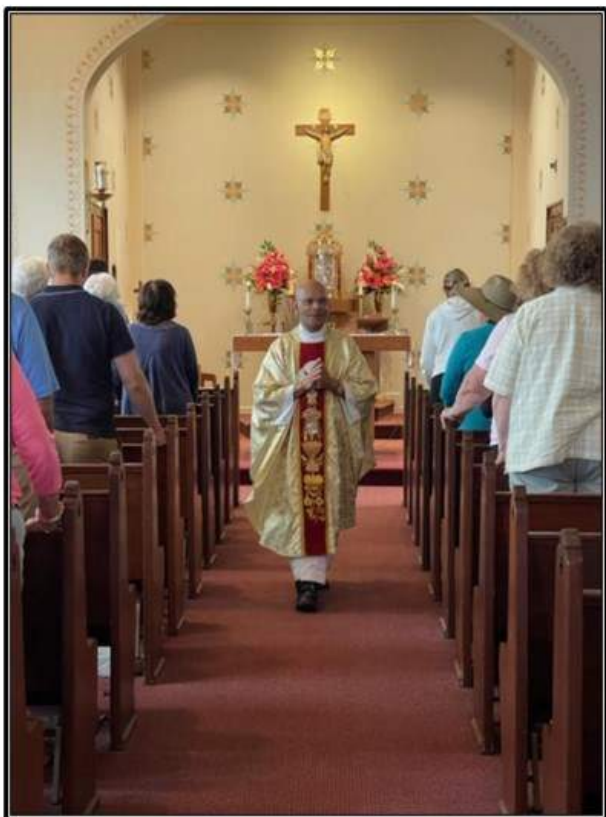
Become a Part of our Faith Community