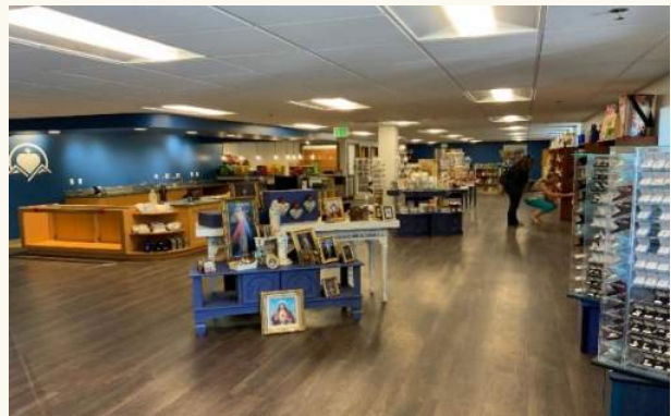
Religious Articles Shop