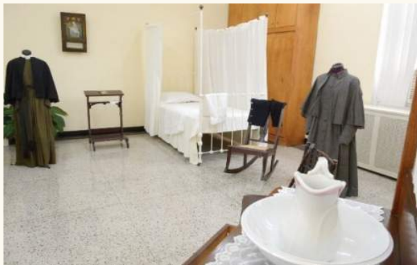
Mother's 1 st & 2 nd class relics on display