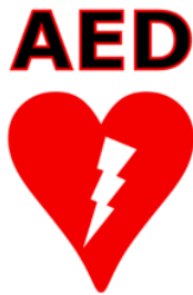
Automated External Defibrillator

An AED, or Automated External Defibrillator, is used to help those experiencing sudden cardiac arrest. It's a sophisticated, yet easy-to-use , medical device that can analyze the heart's rhythm and, if necessary, deliver an electrical shock, or defibrillation, to help the heart re-establish an effective rhythm. Sacred Heart has 2 AED units.