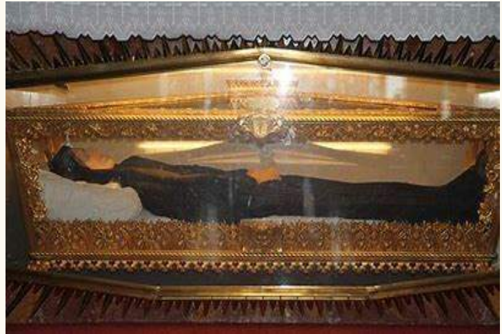
Mother Cabrini's remains in glass casket shaped reliquary