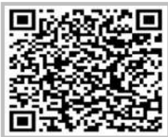
St. Pio's QR Code