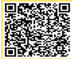
Sacred Heart's QR Code