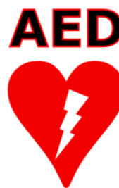
Automated External Defibrillator

An AED, or Automated External Defibrillator, is used to help those experiencing sudden cardiac arrest. It's a sophisticated, yet easy-to-use , medical device that can analyze the heart's rhythm and, if necessary, deliver an electrical shock, or defibrillation, to help the heart re-establish an effective rhythm. Sacred Heart has 2 AED units.