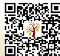
Sacred Heart's Parish Giving