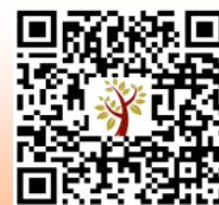
Sacred Heart's Parish Giving