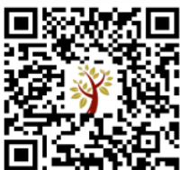
St. Pio's Parish Giving