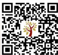
Sacred Heart's Parish Giving