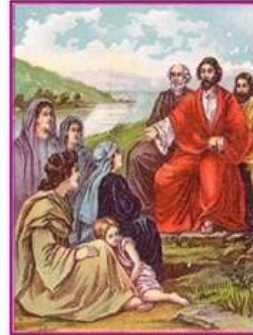
"the Lord opened Lydia's heart" giving her spiritual gifts and abilities to help her in this radical new ministry. She is the first recorded person in Europe to become a follower of Jesus Christ.